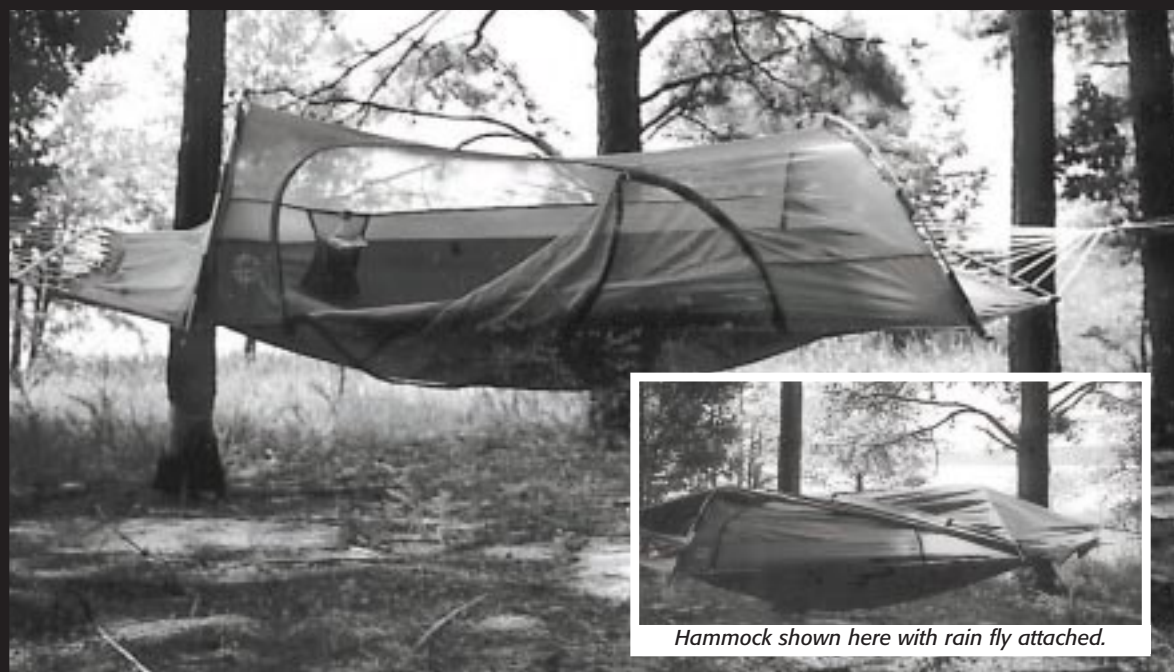
Hammock shown here with rain fly attached.

"The Blue Ridge Camping Hammock, the Finest Jungle Hammock Anywhere."