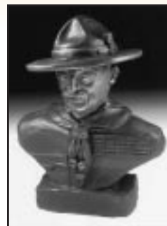
Lord Baden Powell