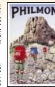
Memories for a Lifetime