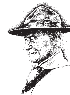
Lord Baden-Powell, "Chief Scout of the World" Item # 2130

We will be adding additional prints of other key figures from Scouting's early history.